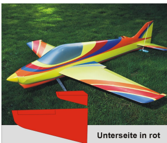
Unterseite in rot

Price reday design like picture left: 1049,58€